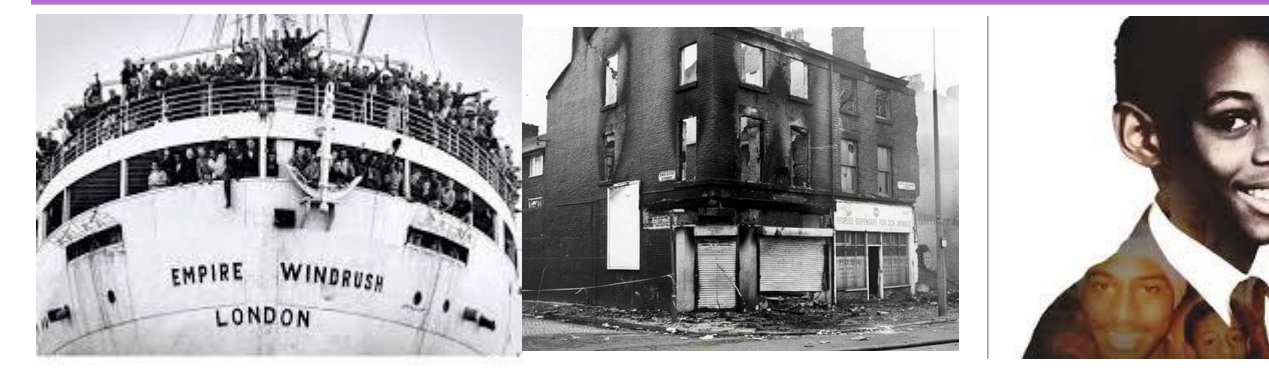
The Windrush arrives in London from the Caribbean - 1948

Unrest in the 1980s including the Highfield Riots in Leicester